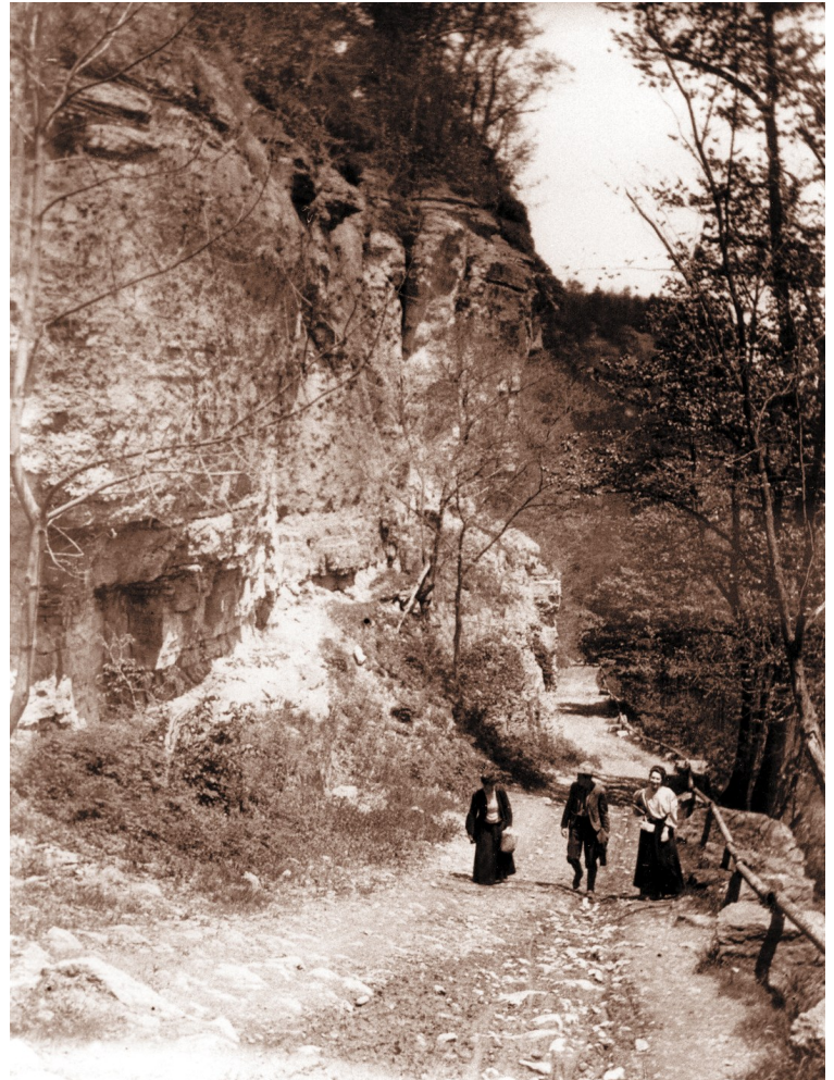
The Old Indian Ladder Road

Check for updates at www.friendsofthacherpark.org